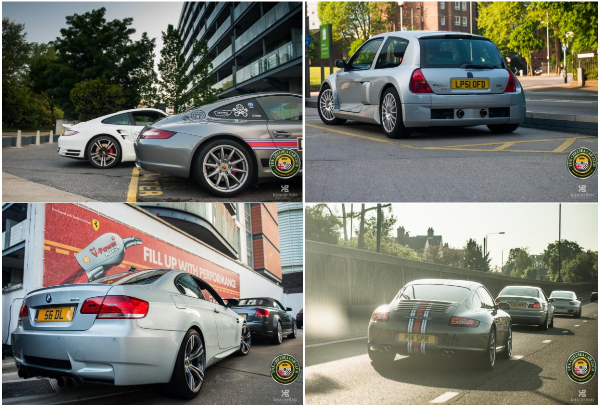
Supercar Siege – Some of the Chelsea Car Club Cars on route!

Well Summer is finally here, and wow we've all been busy! The official Show Season has kicked off and last month we ran a convoy to Supercar Siege at Leeds Castle in Kent where we had a Club display of 12 cars, ranging from a classic '67 Mustang to a V10 R8! So a big thank you to all who came and represented the Club!